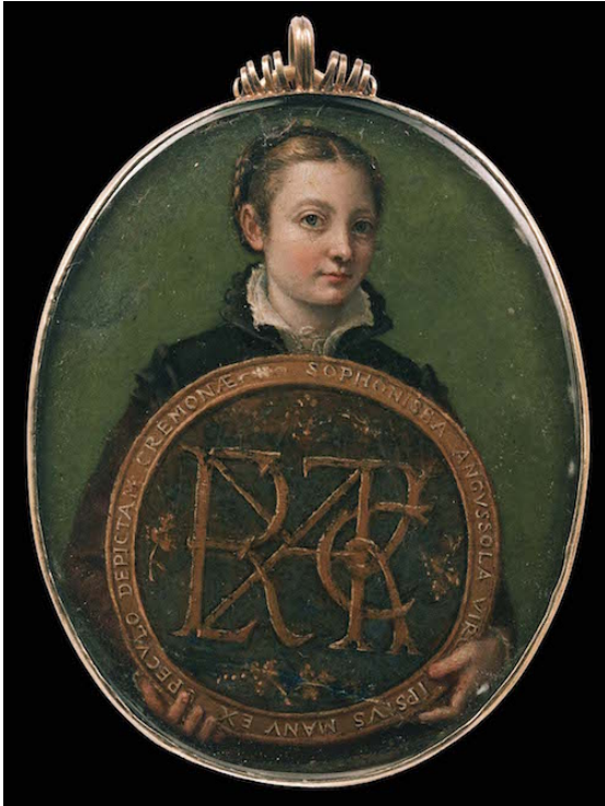
Self-Portrait , c. 1556 by Sofonisba Anguissola from the collection of the Museum of Fine Arts, Boston.

Strong Women in Renaissance Italy will be the focus of the fall 2020 Special Topics Art 187 Course scheduled to start online October 18 and run through November 21, 2020.